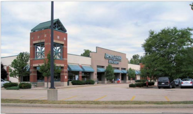
Berkshire Crossing Pittsfield, MA

Name: Michaels Arts & Crafts Berkshire Crossing Address: Pittsfield, MA 01201 Roof Surface & Age: EPDM; >15 years Issues: Leaks at seams, holes in membrane, degraded caulking as well as looking to reduce heat transfer into the building. Coating System: 502 RC-W Elasto-Kote (Coating System) 550 Patch-N-Go (Seam Treatment)