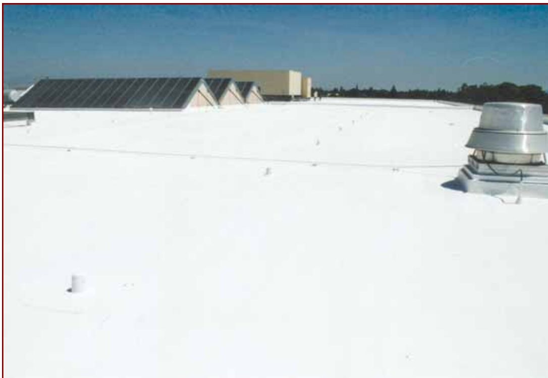
White coatings can provide reflectivity of 70 percent or more.