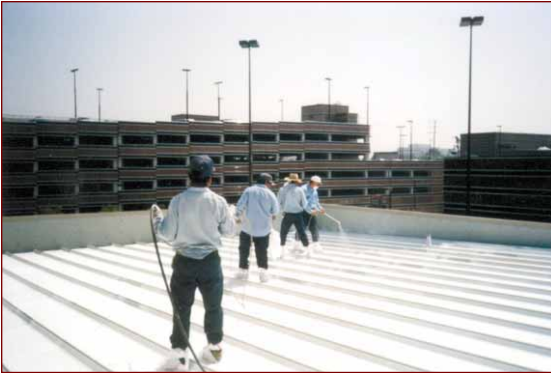
An elastomeric white coating is sprayed on this metal roof in Japan.