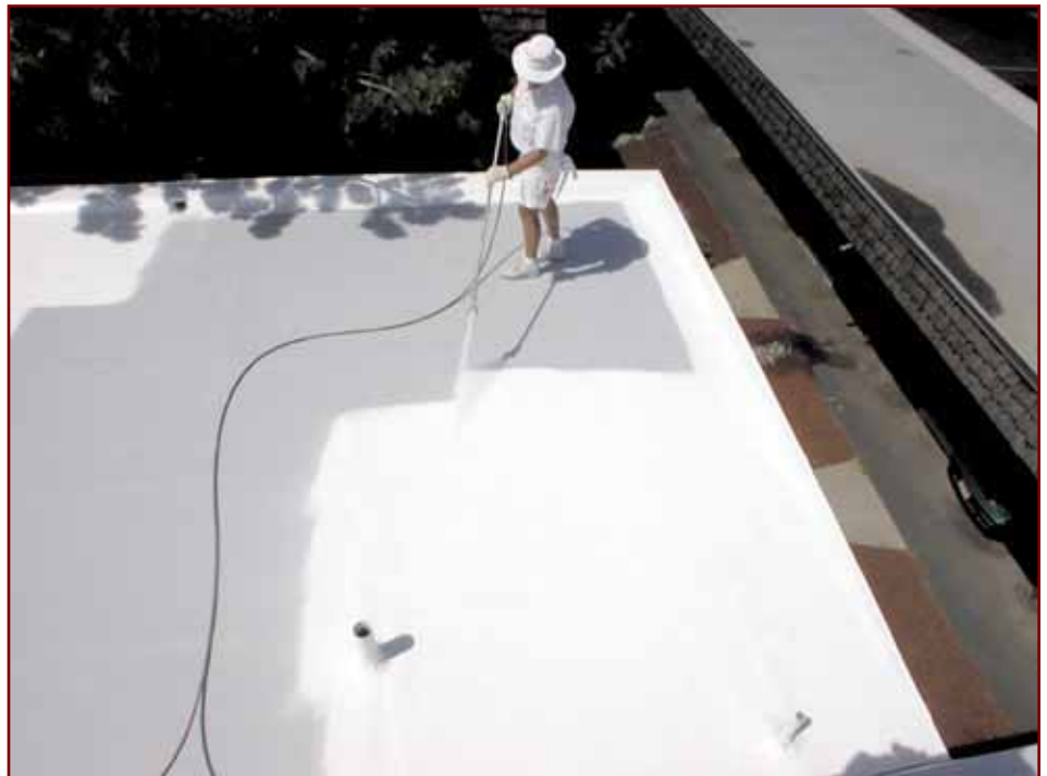
White coatings can be applied on many roof types, including this old BUR on an apartment building in Spokane, Washington. The white coating is sprayed over a base coat on top of an old built-up roof.

Protection Agency (EPA), in the Southwestern states, where the greatest solar resources are located, sufficient solar energy falls on an area of 100 miles by 100 miles to provide all of the nation's electricity requirements [7]. As we cover more and more of the earth's surface with buildings (and that means roof coverings), our choice of those materials determines how much of that heat and light will be absorbed and