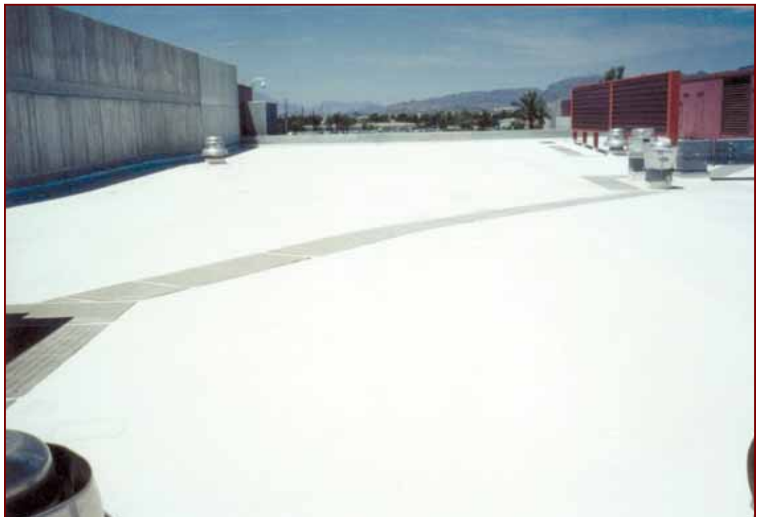
The granulated modified bitumen roof on this Intel facility in Chandler, Arizona, was coated with an elastomeric white coating.

The perm rating should not be confused with weatherability or resistance to weathering. A coating with low permeability still may require a protective topcoat to ensure satisfactory weathering resistance.