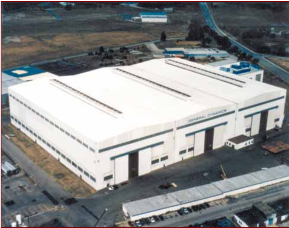
White coatings are appropriate for buildings in temperate climates, such as Groton, Connecticut, where such a product was installed over the metal roof of a General Dynamics facility.

stored through roofing in our buildings.